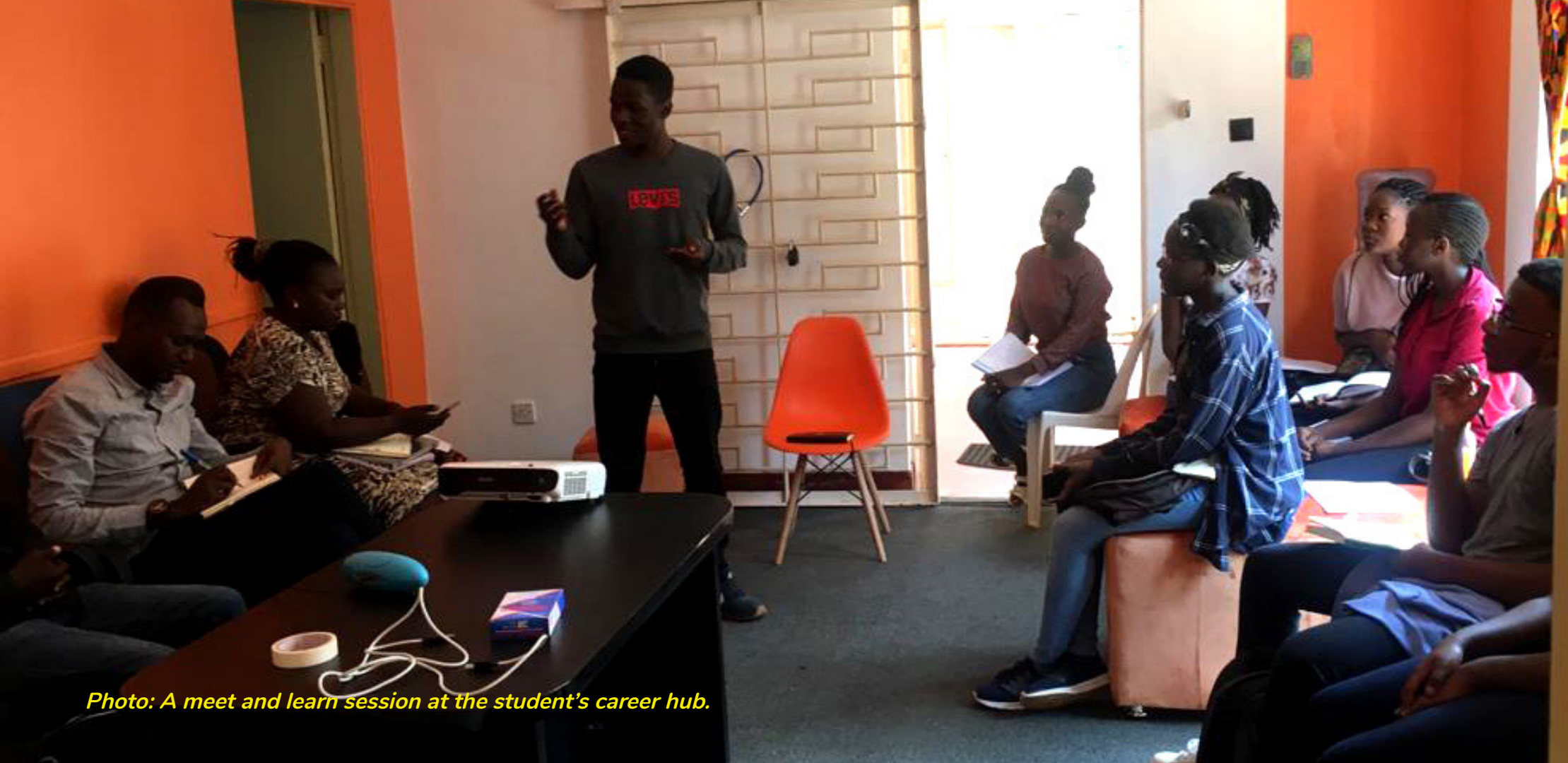
Photo: A meet and learn session at the student's career hub.