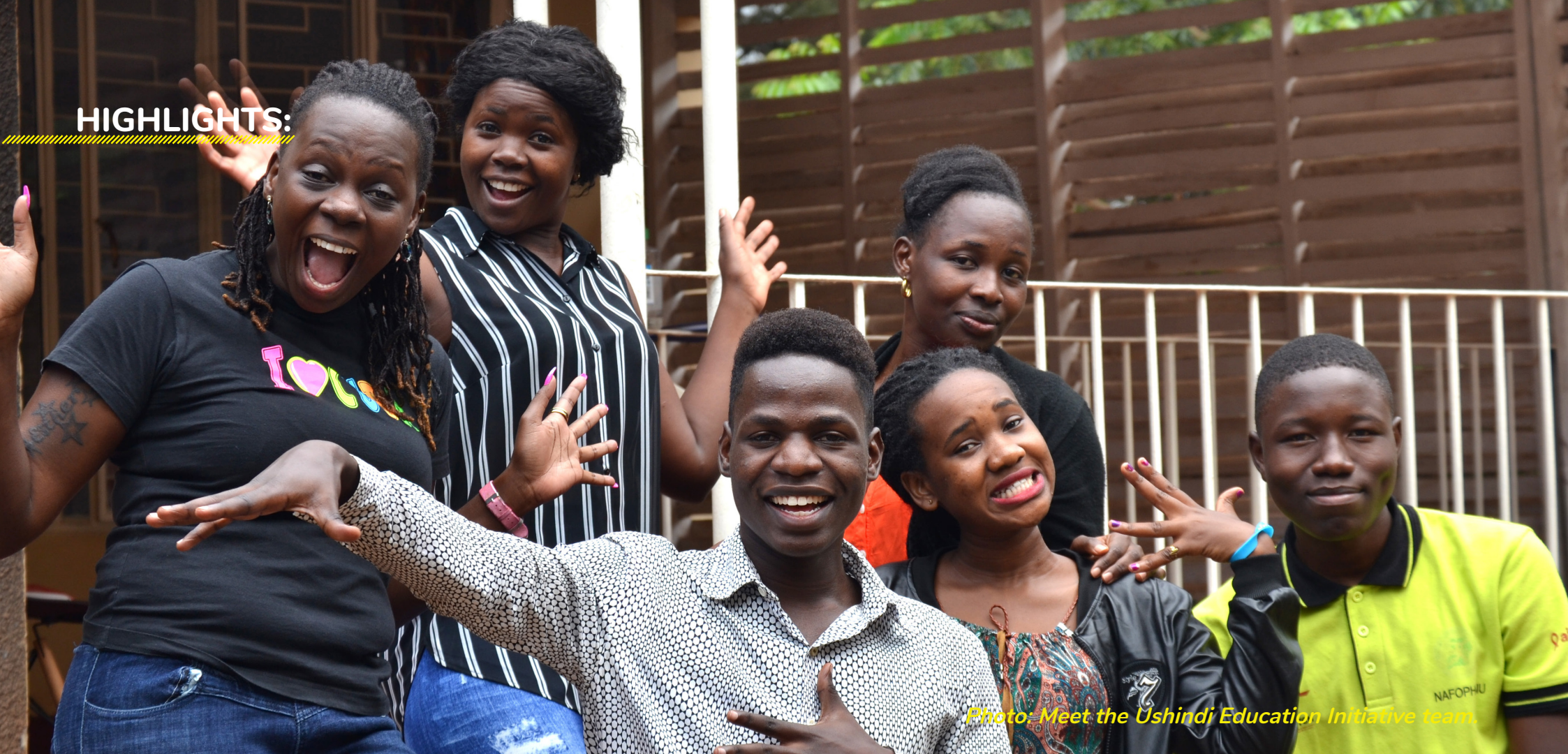
Photo: Meet the Ushindi Education Initiative team.