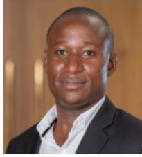
Arnold Habyarimana Democratic Republic of the Congo